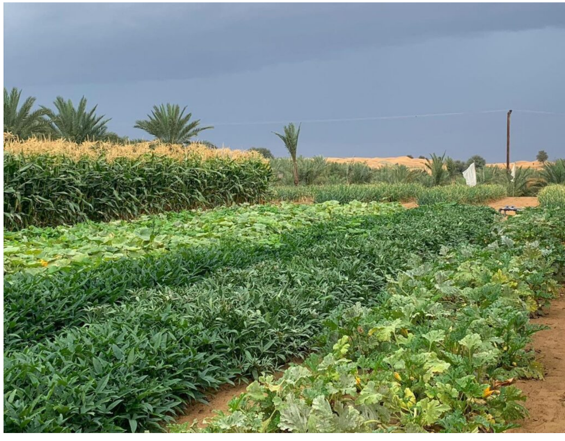
Greenheart Organic Farms

“It took me a while, but eventually, I became hooked on it, and teamed up with some Emirati friends who had farms here. It wasn’t until the birth of my daughter though that I felt the urge not only to grow produce for my family and friends, but for the families around me. The more success I had, the more I wanted to shout out to the world, ‘Look what we can do! We don’t need chemicals to grow food. We are doing this right in the middle of the UAE desert, and look what we can achieve without using all those nasty toxins!’