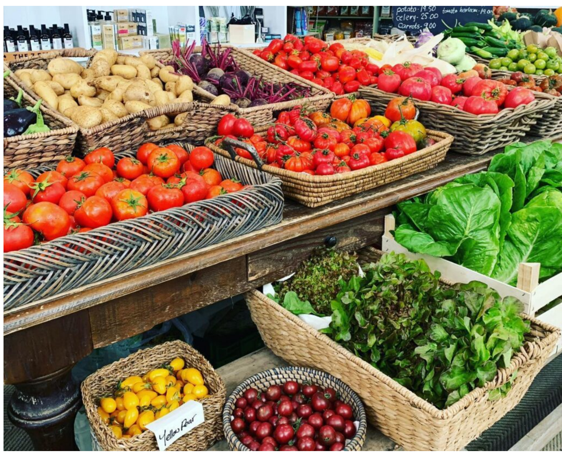
Greenheart Organic Farms

With the aim of making the way they farm and conduct their business the norm for fresh food production and retailing, Elena wants to be able to extend the reach of Greenheart Organic Farms, so more people can eat healthy, sustainable food, as well change consumer behaviour.