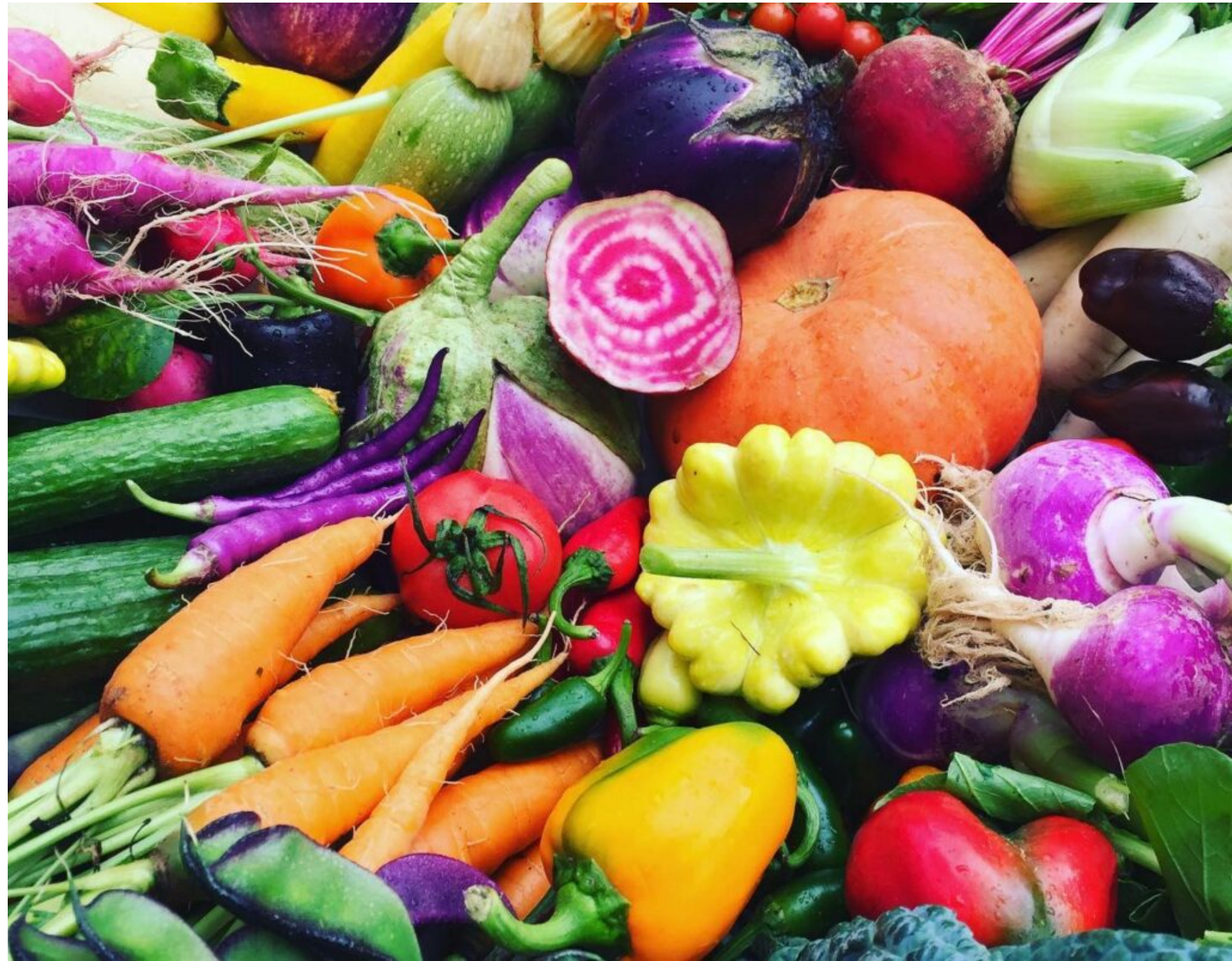
Greenheart Organic Farms

MOJEH meets Elena on a busy Thursday morning (prior to the UAE’s lockdown) in her farm shop in Dubai’s Barsha South, just as the day’s delivery has arrived. “Greenheart grows genuine organic vegetables, greens and fruit in the UAE desert. We build soil, make many of our own fertilizers and remedies, and collect our own seeds,” she explains, showing us around the shop packed with woven baskets loaded with juicy home-grown heirloom tomatoes, lush bunches of herbs and fresh, crunchy apples.